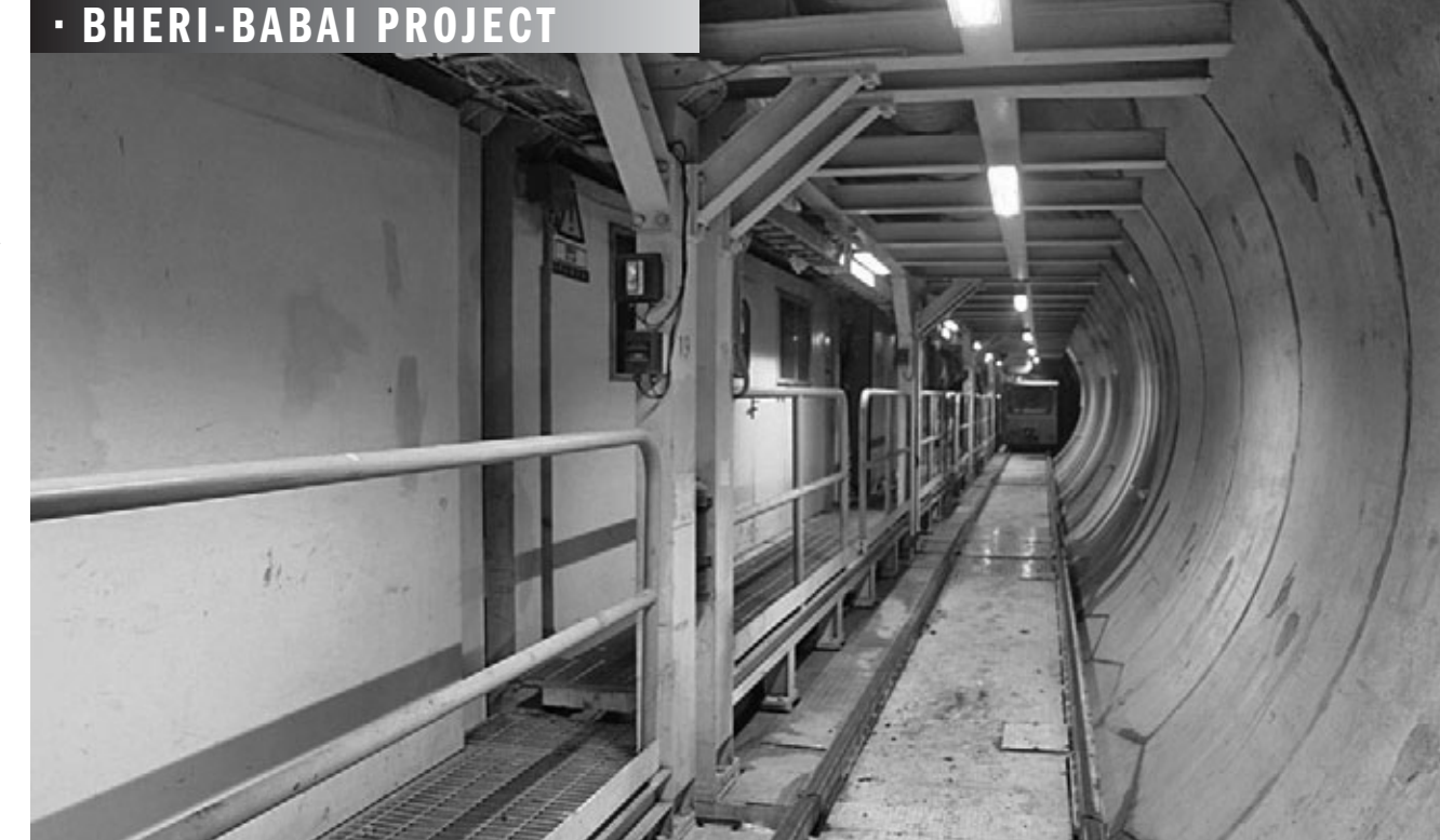
An under-construction tunnel of Bheri-Babai Diversion Multipurpose Project, in Surkhet, on Wednesday.

Located between Bardiya of Province 5 and Karnali Province, the machine is digging 40 metres tunnel daily. Upadhyay said the tunnel boring machine had already crossed Tolikhola, which was considered